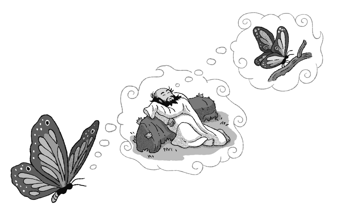
Figure 1 Zhuangzi's butterfly dream. Was he Zhuangzi who dreamt he was a butterfly, or a butterfly dreaming he was Zhuangzi?

Zhuangzi can't be sure that the life he's experiencing as Zhuangzi is real. Maybe the butterfly was real, and Zhuangzi is a dream.